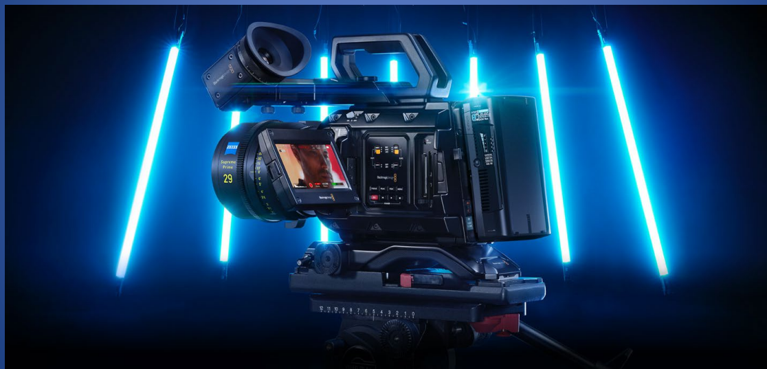
Blackmagic URSA Mini Pro 12K